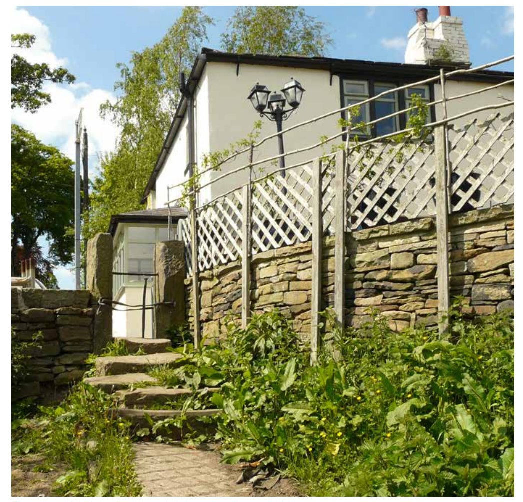
The stile which links the Miners' Hole to the village of Whitley.

the road, pass the church and continue to the next T-junction.