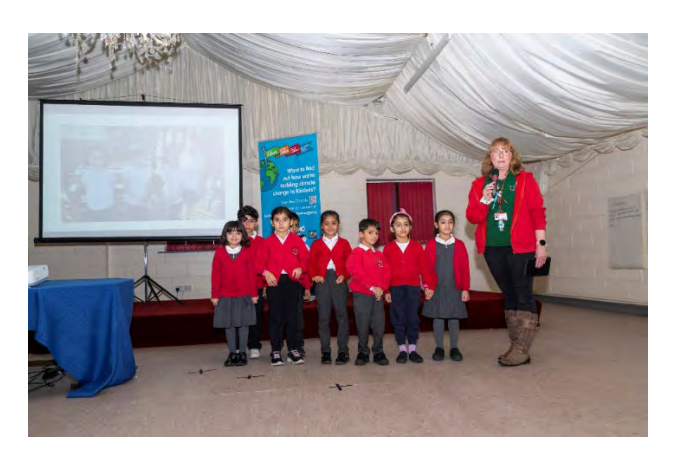
Presentation from pupils Diamond Wood Academy