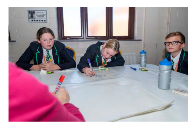
Pupils from BBG Academy