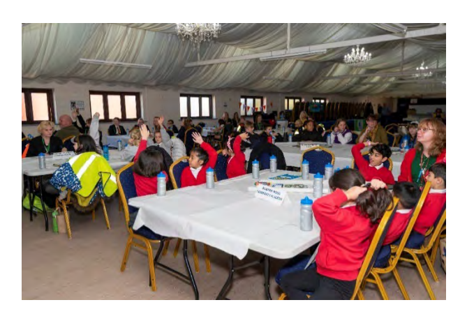
Main festival Hall schools answering workshop questions