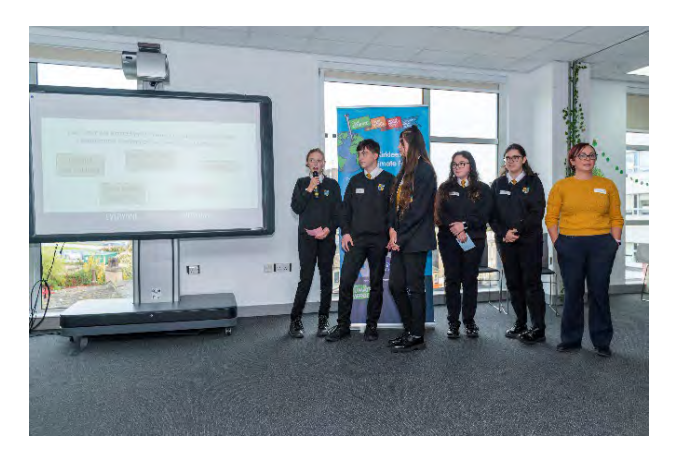
Presentation from Newsome Academy