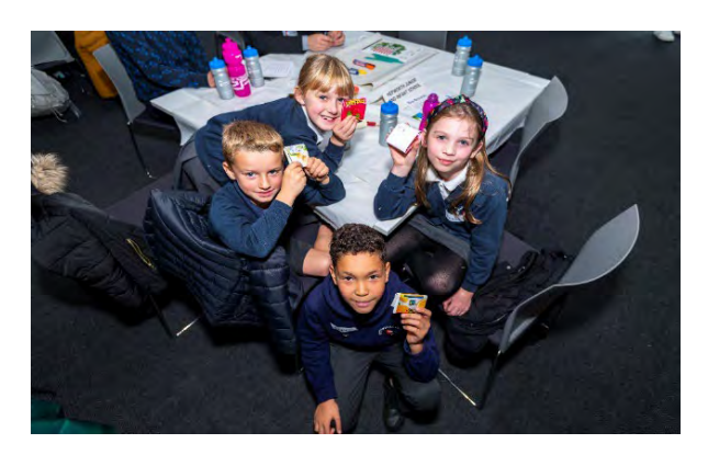
Pupils from Hepworth Junior and infant school