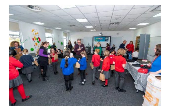
Schools browsing the various stalls