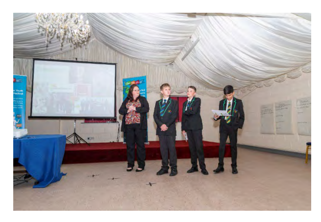
Presentation from pupils at Batley High School