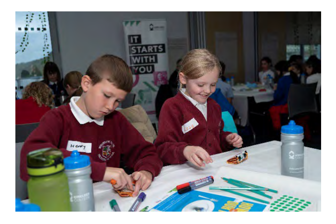
Pupils from Meltham Moor Primary School