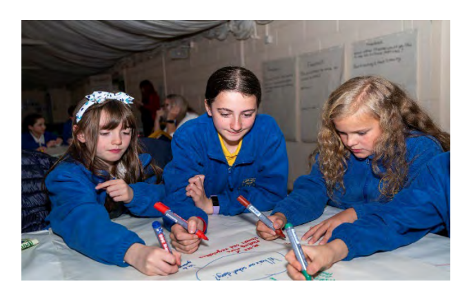
Pupils from Scapegoat Hill Junior and infant school