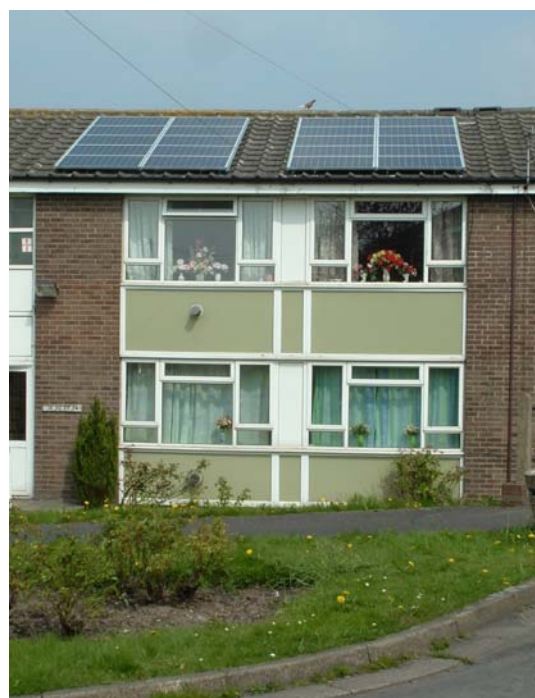
Solar PV panels installed at Primrose Hill