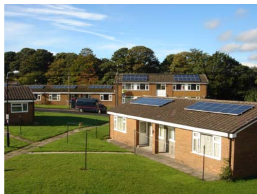
Fernside solar village: 100 solar PV panels

The solar PV arrays on the SunCities homes were rated between 1 kWp and 1.3 kWp. Each project was tendered separately, so there is a mixture of mono- and poly-crystalline PV and several different PV manufacturers, including Astropower, NAPS and BP Solar. All the inverters were made by Fronius.