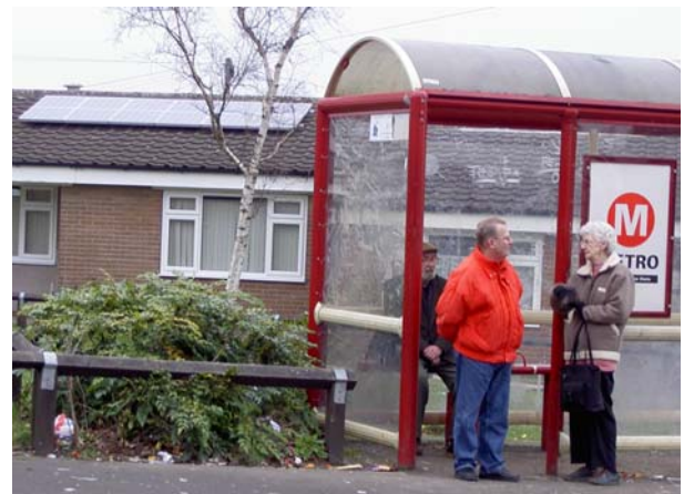
Residents at Fernside solar village

The high visibility of the Kirklees SunCities projects has raised awareness in the community which has resulted in positive feedback from the community regarding solar PV, as demonstrated by the results from the recent TalkBack survey that when asked the question " Which of the following 'renewable' energy sources should be used more often in Kirklees? ", 83% of respondents replied 'solar panels on public buildings' and 73% of respondents replied solar panels on people's houses.