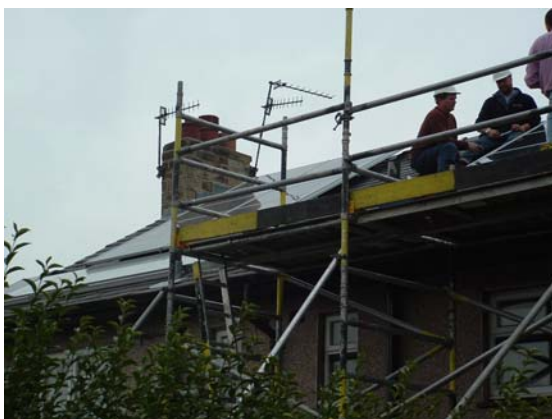
Local installer at Primrose Hill

Kirklees is using the SunCities expertise to inform development of other renewable energy projects.