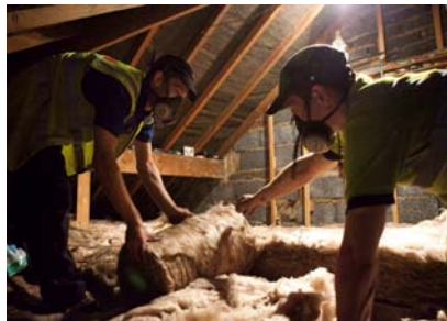
Loft insulation being installed