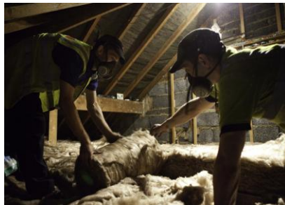
Loft insulation being installed