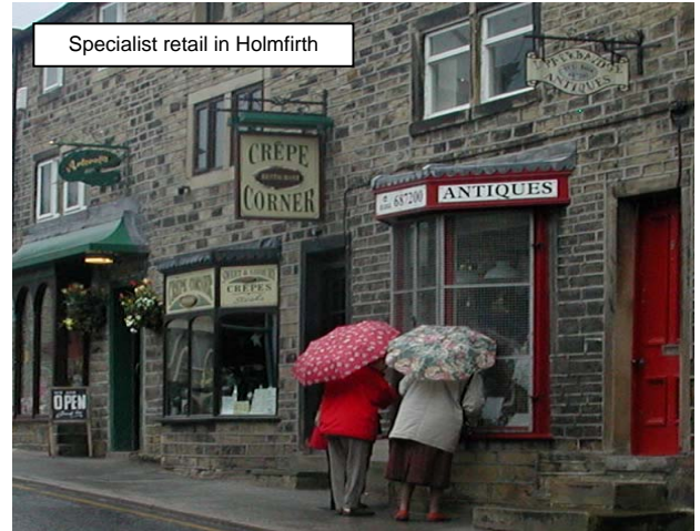
Specialist retail in Holmfirth

Although every care and effort has been made to ensure the accuracy of the data and statements contained in this publication, Planning Services does not accept responsibility for any errors or inaccuracies which may have occurred therein.