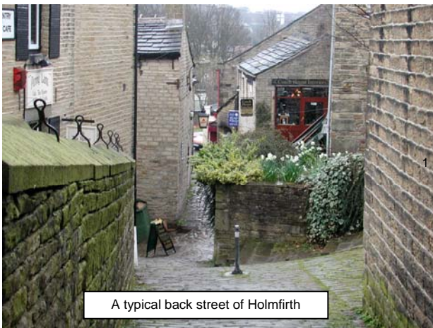
A typical back street of Holmfirth

The Victoria Street bridge over the River Holme is currently the subject of improvement works which has caused some disruption in the town. However, the project is necessary in order to strengthen the bridge that has been weakened over the years due to heavy traffic. There are also plans to create a riverside footpath along the River Holme along with possibly a footbridge linking the bus station with the Old Bridge Hotel car park.