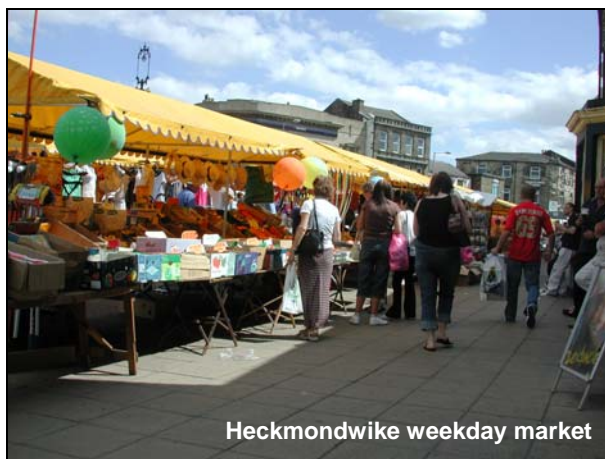
Heckmondwike weekday market

Within the more traditional retail area of the town, zone A rental levels achieve a maximum of around £194 per sq.m. which also remains unchanged from last year.