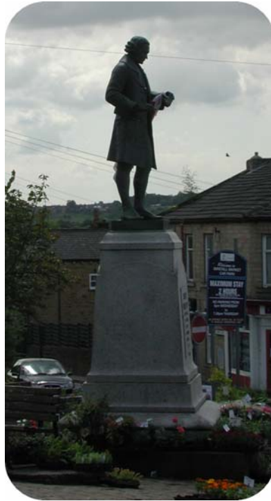
Joseph Priestley Statue, Market Place