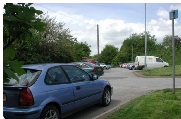
High Street car park

Birstall has a car parking to floorspace ratio of 51.3 spaces per thousand sq.m of occupied retail floorspace. This compares well with similar sized towns elsewhere in the district and exceeds the provision of 43.2 per thousand sq.m in Mirfield.