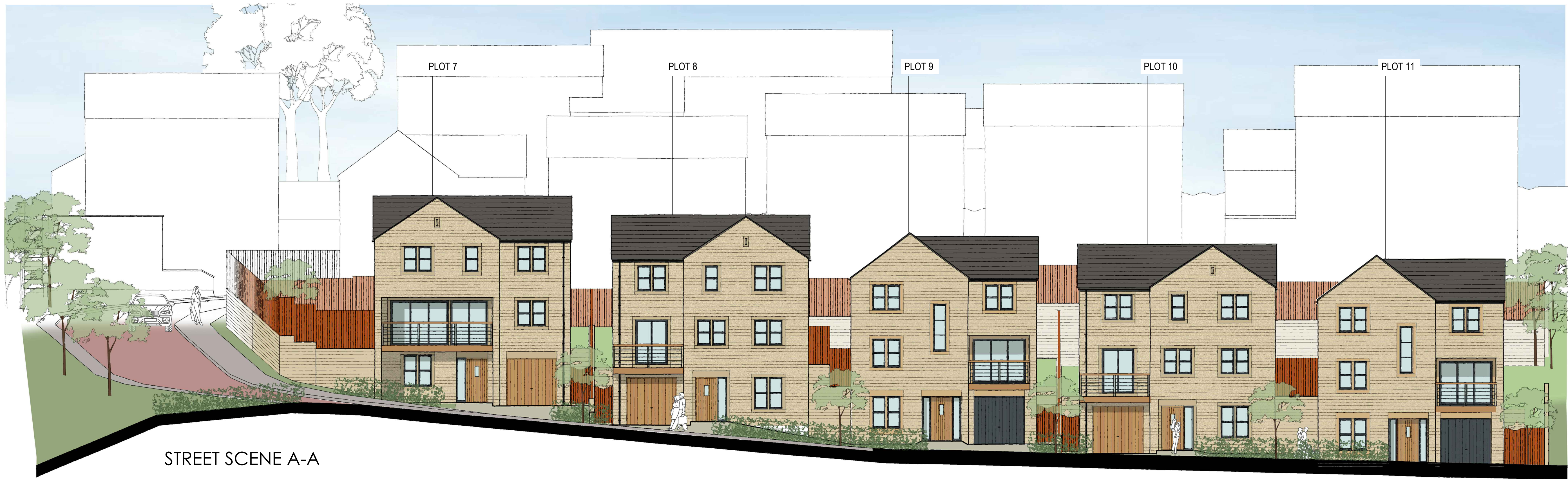
STREET SCENE A-A