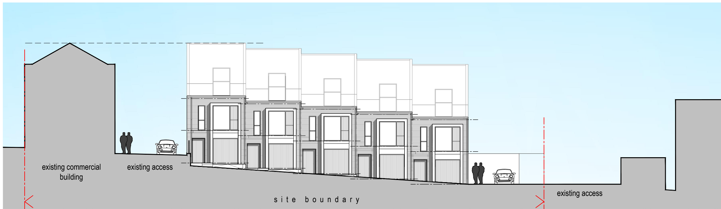
north facing general elevation scale 1 : 200 @ A1