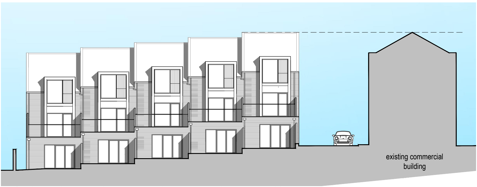
south facing general elevation scale 1 : 200 @ A1