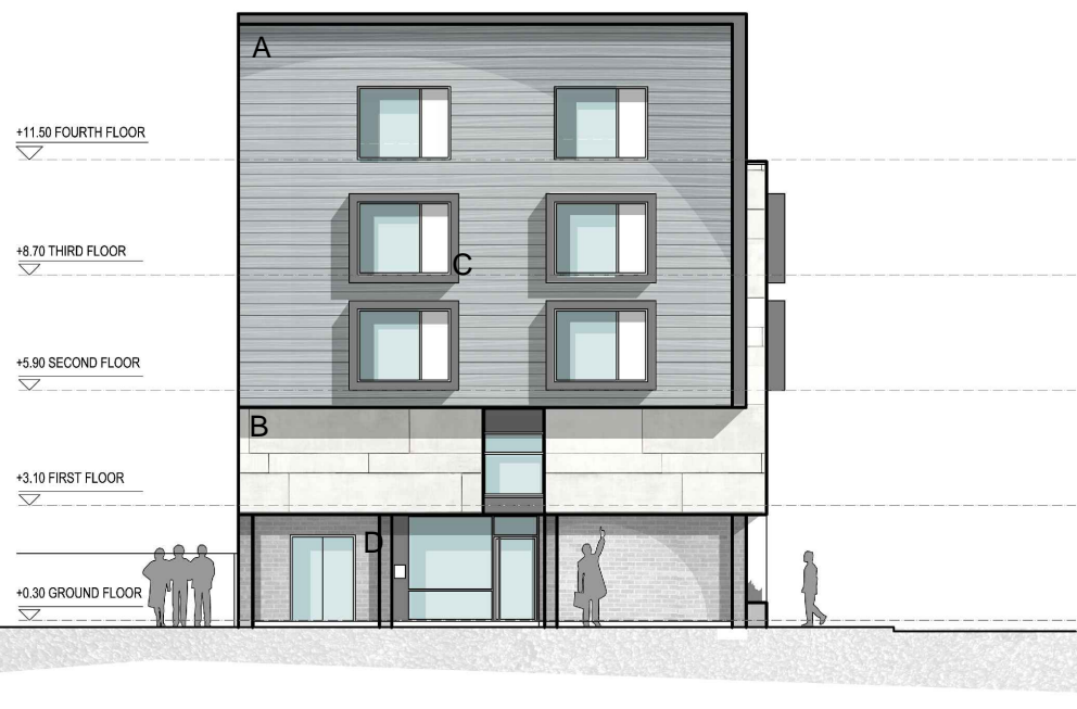
E4-PROPOSED SAND STREET REAR ELEVATION SCALE 1:200

All dimensions are to be checked on site, any discrepancies are to be reported to the Architect before work commences. Do not scale from this drawing. This drawing is to be read in conjunction with all relevant consultants and specialists drawings / documents, any discrepancies are to be reported to the Architect before the affected work commences. All structural components shown are indicative only. Details / calculations of structural members are to be provided by the Structural Engineer. This drawing is copyright.