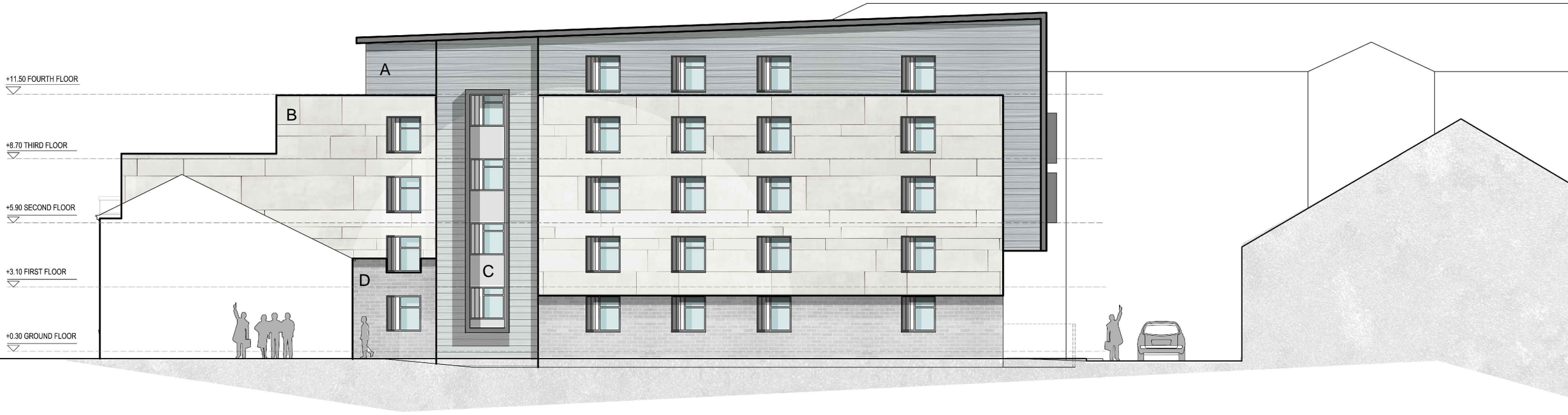
E3-PROPOSED SAND STREET ELEVATION SCALE 1:200