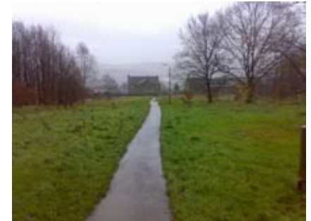
Open space and view to the heys