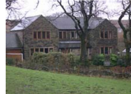
New development with vernacular details

The principal activity within the Helme conservation area is residential although educational activity is also a major element due to the size and position of Helme Church of England Junior and Infant School. There appears to be a low level of vehicular through traffic and although there is a pinch point in the narrow highway this does not appear to create any major traffic hazard. There is agricultural activity within Helme and commercial interest in the form of the Helme Hall Nursing Home and stables to the north.