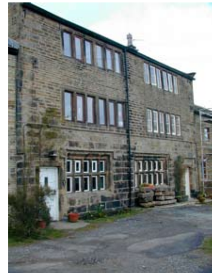
10 - 12 Slades Lane