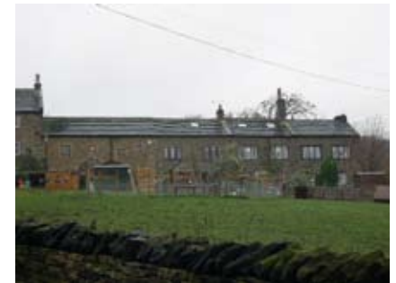
Terrace at 4 - 8 Slades Lane