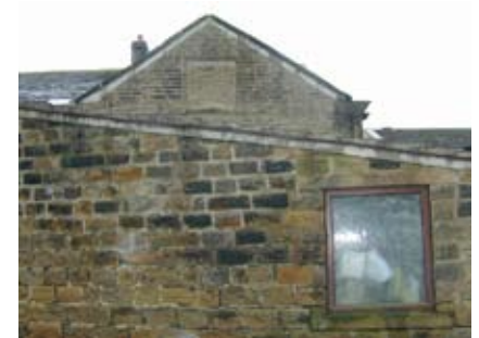
Blocked window and kneelers