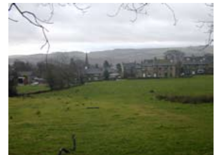
Gateway from Helme Wood