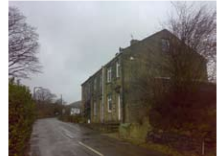
Terrace at 18 - 28 Slades Lane