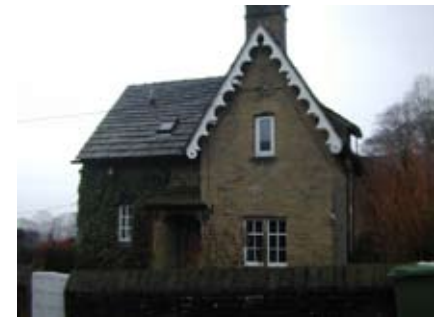
Barge boarding at the Heys