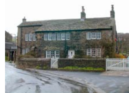
14 - 16 Slades Lane