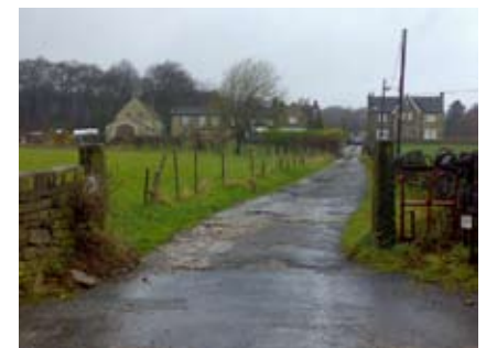
Gateway to the Heys