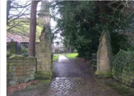
Glimpse through Christ Church gatepiers

These are marked on the Townscape Appraisal Map