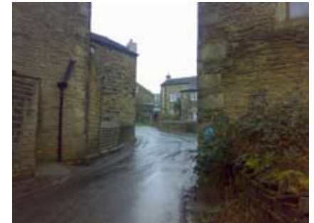
Gateway at the entrance

This part of the settlement includes the later community buildings, the vicarage and a large modern building to the east. It represents the later development of the conservation area and the planned rather than organic growth. This is an attractive area of open space and wooded areas.