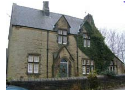
15 Slades Lane