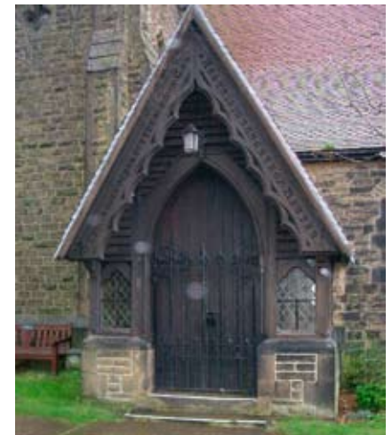
Entrance to Christ Church