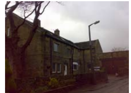
39 Slades Lane