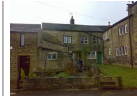
27 Slades Lane

Most of the buildings in Helme are in good condition. There is one building, which appears to be falling into disrepair and requires a minimum amount of maintenance. This is number 27 Slade Lane, which is a pleasant building and is not detracting from the conservation area but will require attention to maintain the overall appearance.