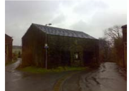
Barn opposite number 33