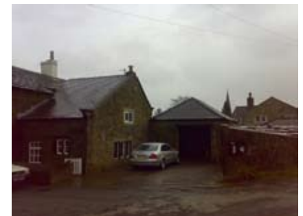
Haphazard arrangement at the historic core