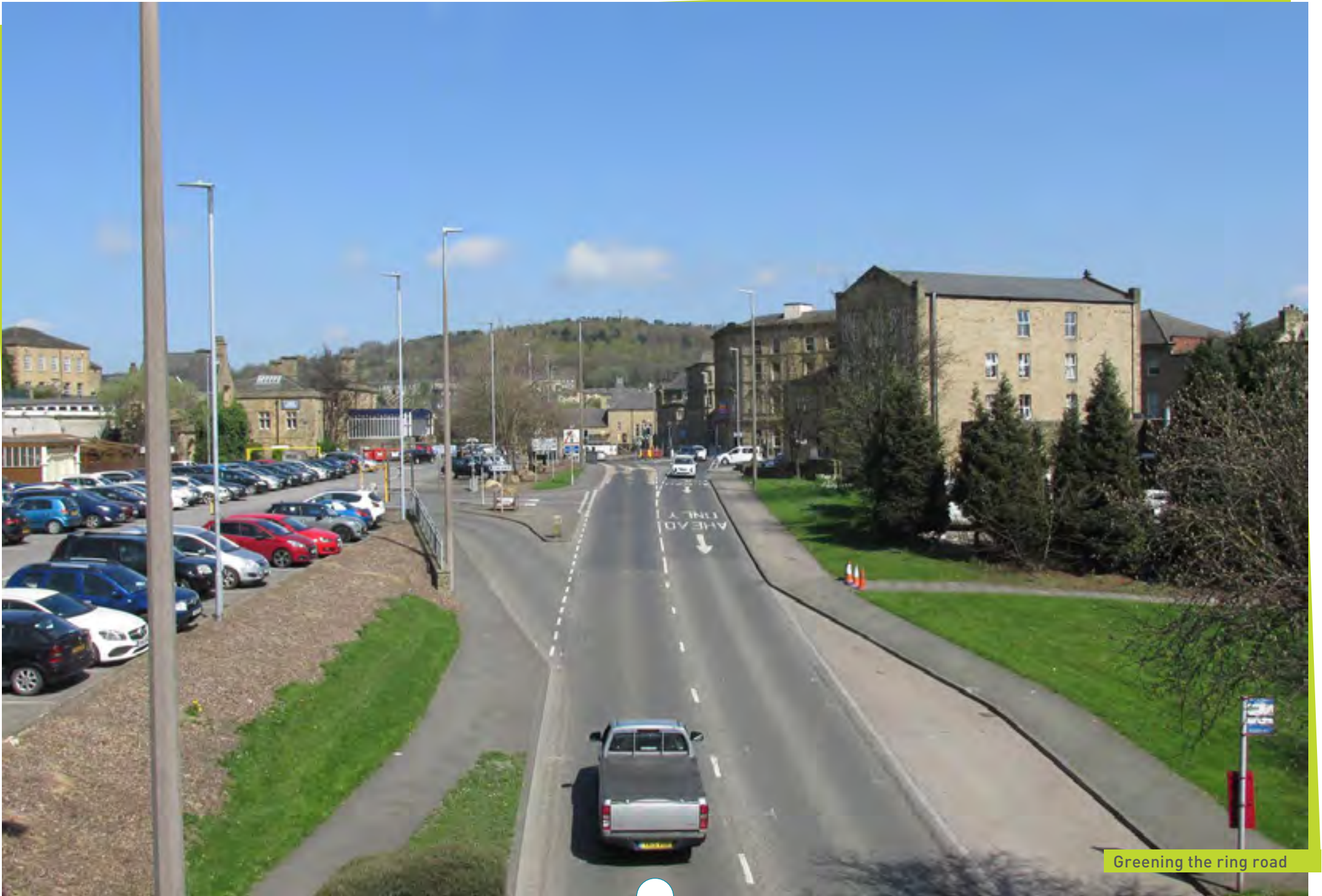
Greening the ring road