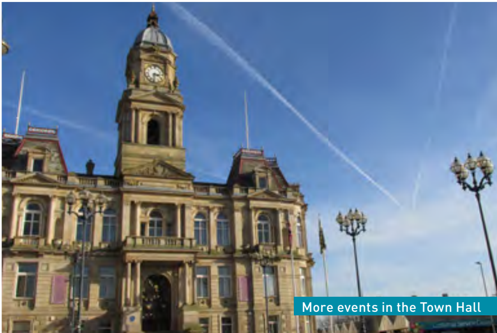
More events in the Town Hall