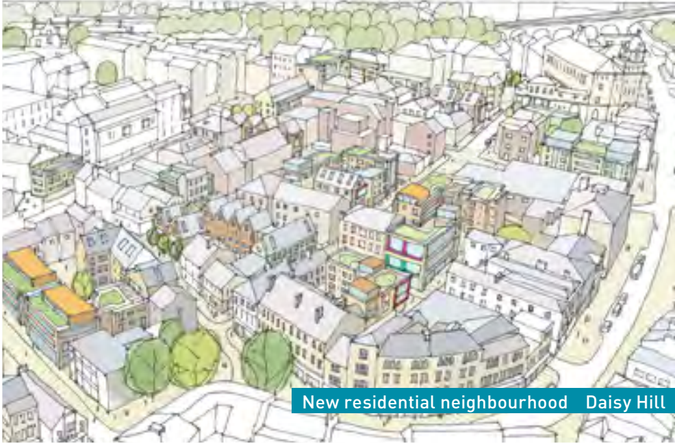
New residential neighbourhood Daisy Hill