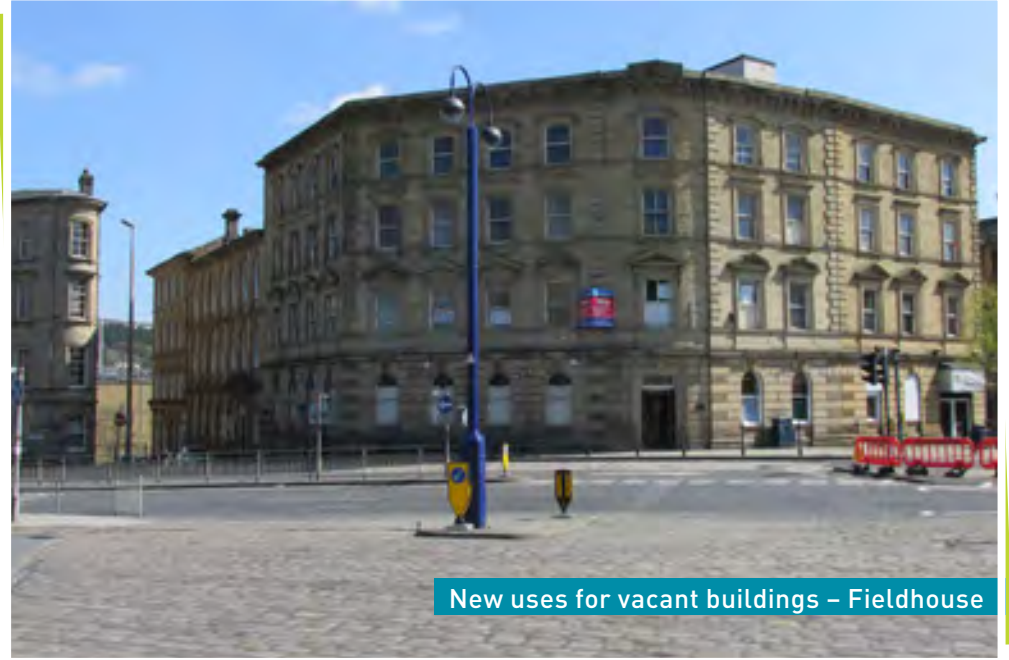
New uses for vacant buildings - Fieldhouse