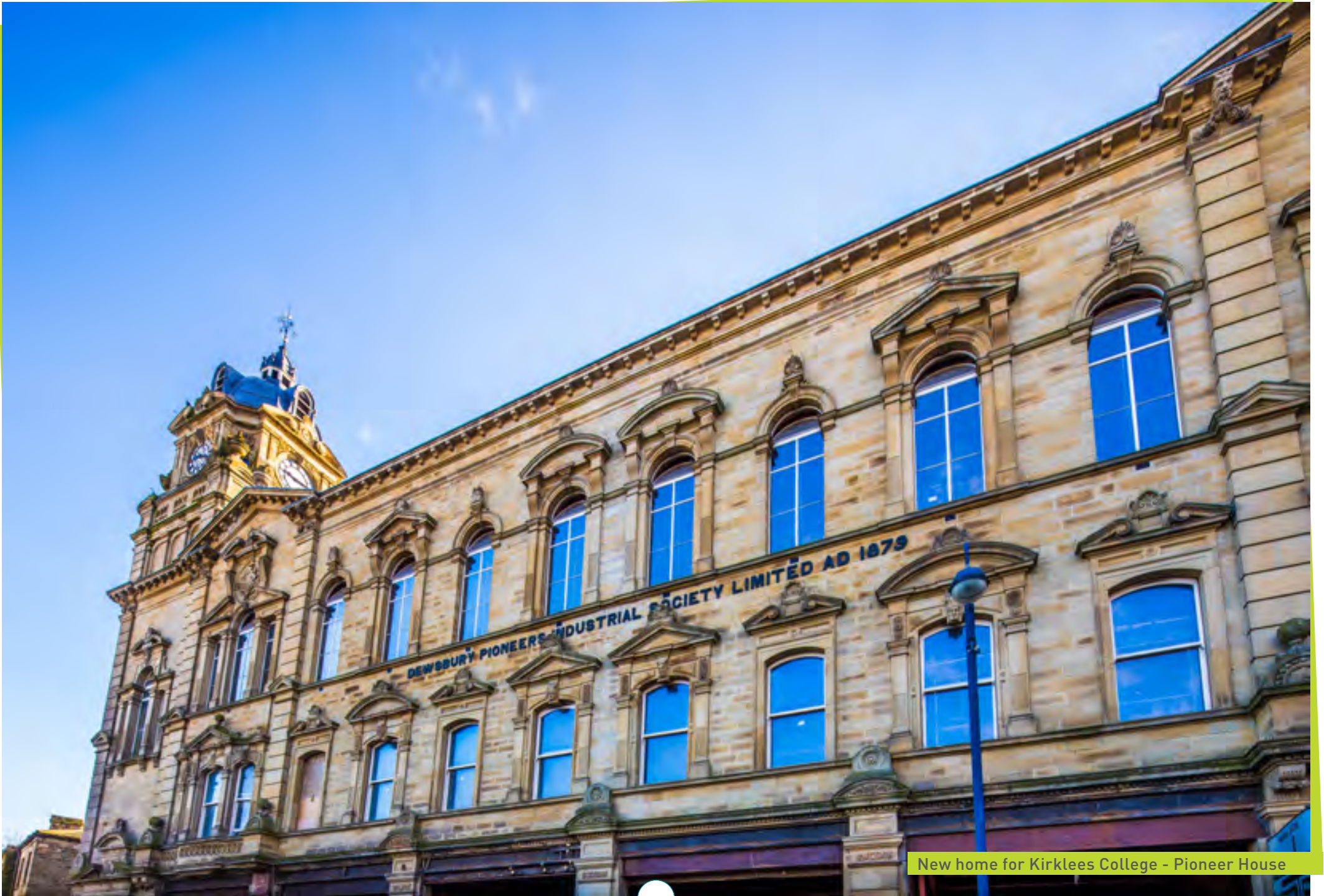
New home for Kirklees College - Pioneer House