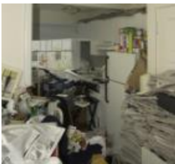
4 5 6