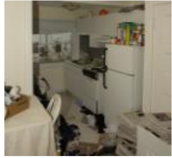
1 2 3