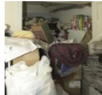
7 8 9